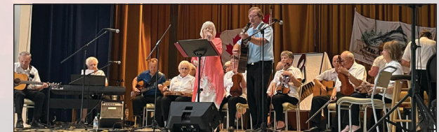
KITCHEN PARTY CREW